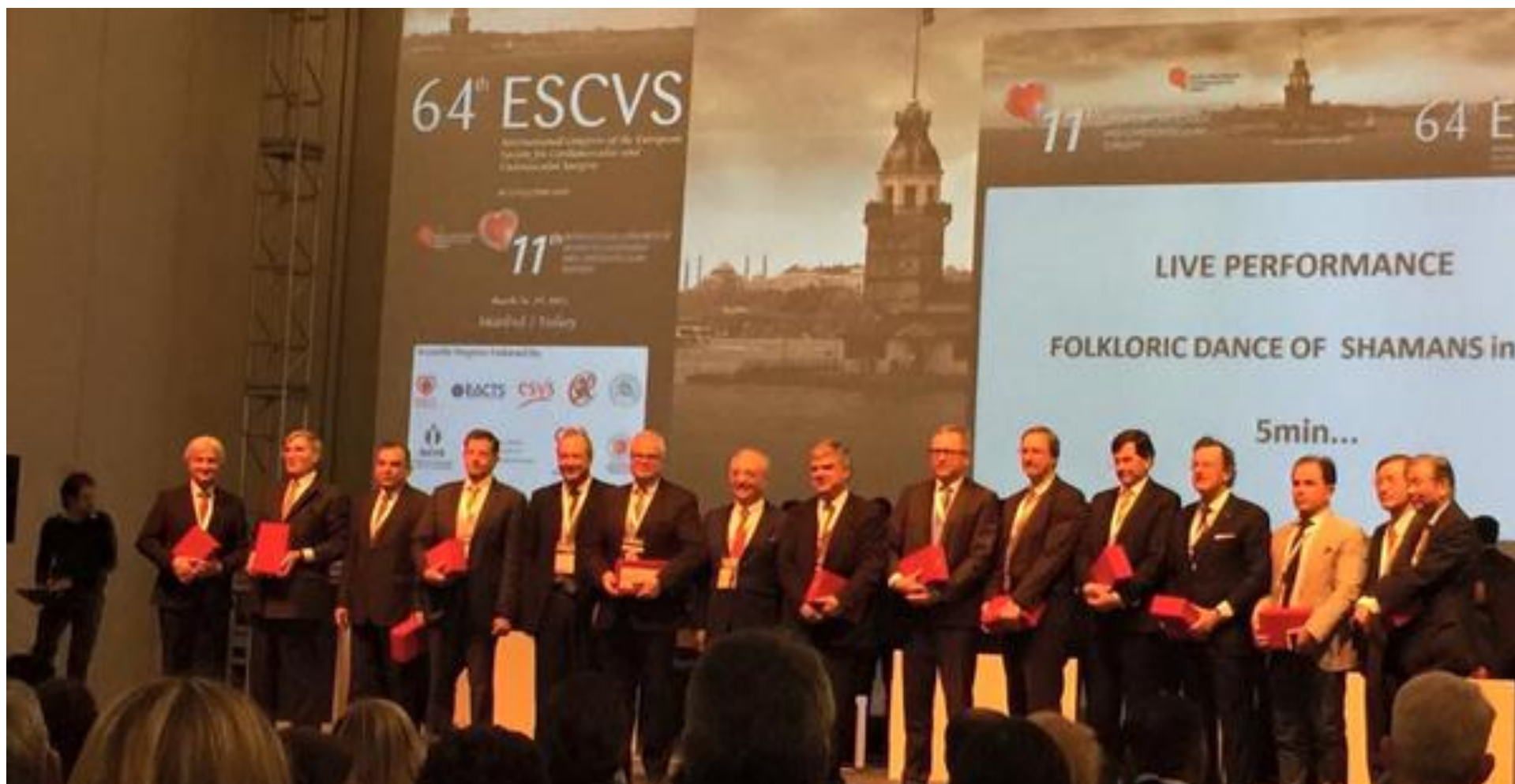
At the opening ceremony of 64th ESCVS congress

Sessions regarding updates in Carotid Surgery and Treatment of Venous Disease also took place and captured attention of attendants.